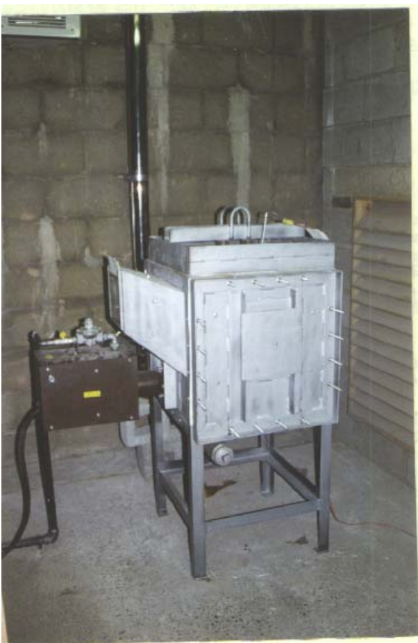
Figure 1 Prometheus Developments Laboratory Fire Test Furnace.

This allows us to simultaneously evaluate a number of interacting variables. Every designer working in the field must have available some form of rapid assessment system. Certainly, the 1 metre cube furnace, employing one metre columns, is far too slow and cumbersome to be a development tool, and should be reserved for the final stages of evaluation prior to moving to full scale fire tests.